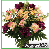
Purple Peony w/Pink and Cream Orchids