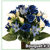
Blue Rose with Blue Tiger Lily