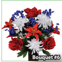
Red, White & Blue Mix