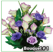
Purple Rose and Calla Lily Mix