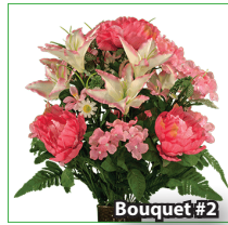
Pink Peonies and Hydrangea