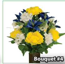
Blue Stargazer w/Yellow Peony and Hydrangea