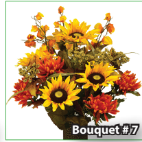
Sunflower and Dahlia